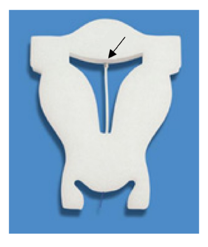
Figure 1 FibroPlant® LNG-IUS releasing 14 \mu g or 20 \mu g of LNG/day has a diameter of 1.2 mm and 1.6 mm, respectively. The stainless steel clip securing the fiber to the anchoring thread is shown (arrow).

A total of 304 women were included in the contraceptive study. Most women were parous; only 14% of the participants were nulliparous women. Women were screened for their clinical suitability for intrauterine device (IUD) insertion and compliance with the World Health Organization (WHO) eligibility criteria. The experimental use of the Fibroplant LNG-IUS